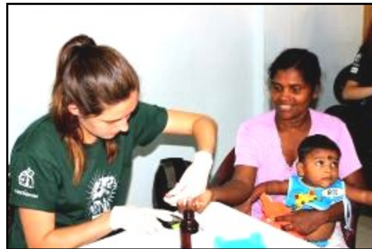
Volunteers help with blood pressure checks

Our medical volunteers initially worked as three teams within one group for checking the blood sugar, another group for checking the blood pressure, and one group was with the doctors getting to know the conditions. There was a volunteer who was a pharmacist who actually worked with the pharmacy where all the medications were