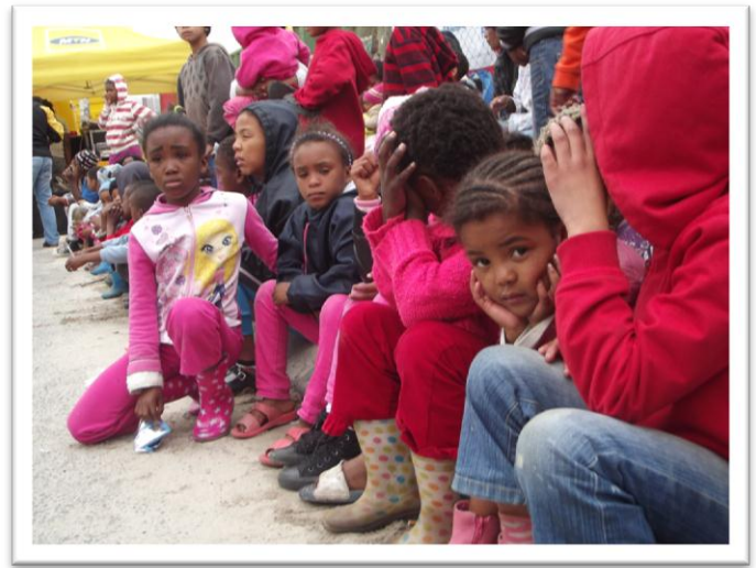
Children from Vrygrond gathered at to celebrate Youth Day

We are now 20 years into our democracy and 38 years since our then youth took to the streets in an effort to claim the freedom that we enjoy today. Our country is now a place where the youth is presented with endless opportunities that allow them to celebrate their diversity in all its colours.