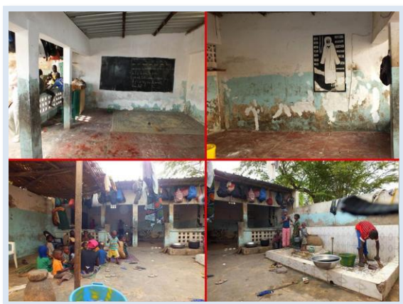
before the renovation

Have a look at the work of our Two Week Special volunteers before and after the renovation.