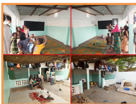
After the renovation